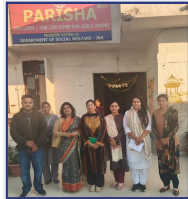
Visit to Phulwari Cradle Baby Reception Centre (SAA); Parisha, Children/Shelter Home for Girls Jammu (CCI) & Palash, Children/Shelter Home for Boys (CCI) in Jammu, J&K on 28th November 2023