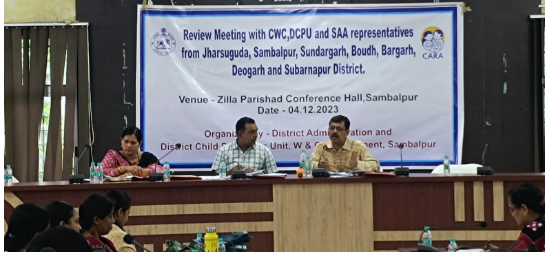
Review Meeting with CWC, DCPU & SAA representatives in Sambhalpur, Odisha on 04th December 2023