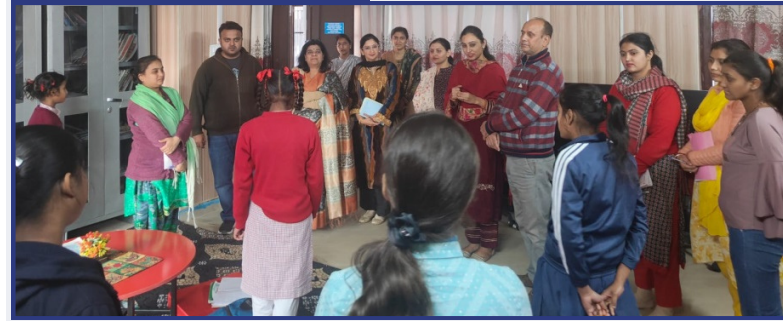
Visit to Bharatiya Samaj Seva Kendra (SAA); SAKAR (SAA) & Lions Bal Club (CCI) in Aurangabad, Maharashtra on 30th November 2023